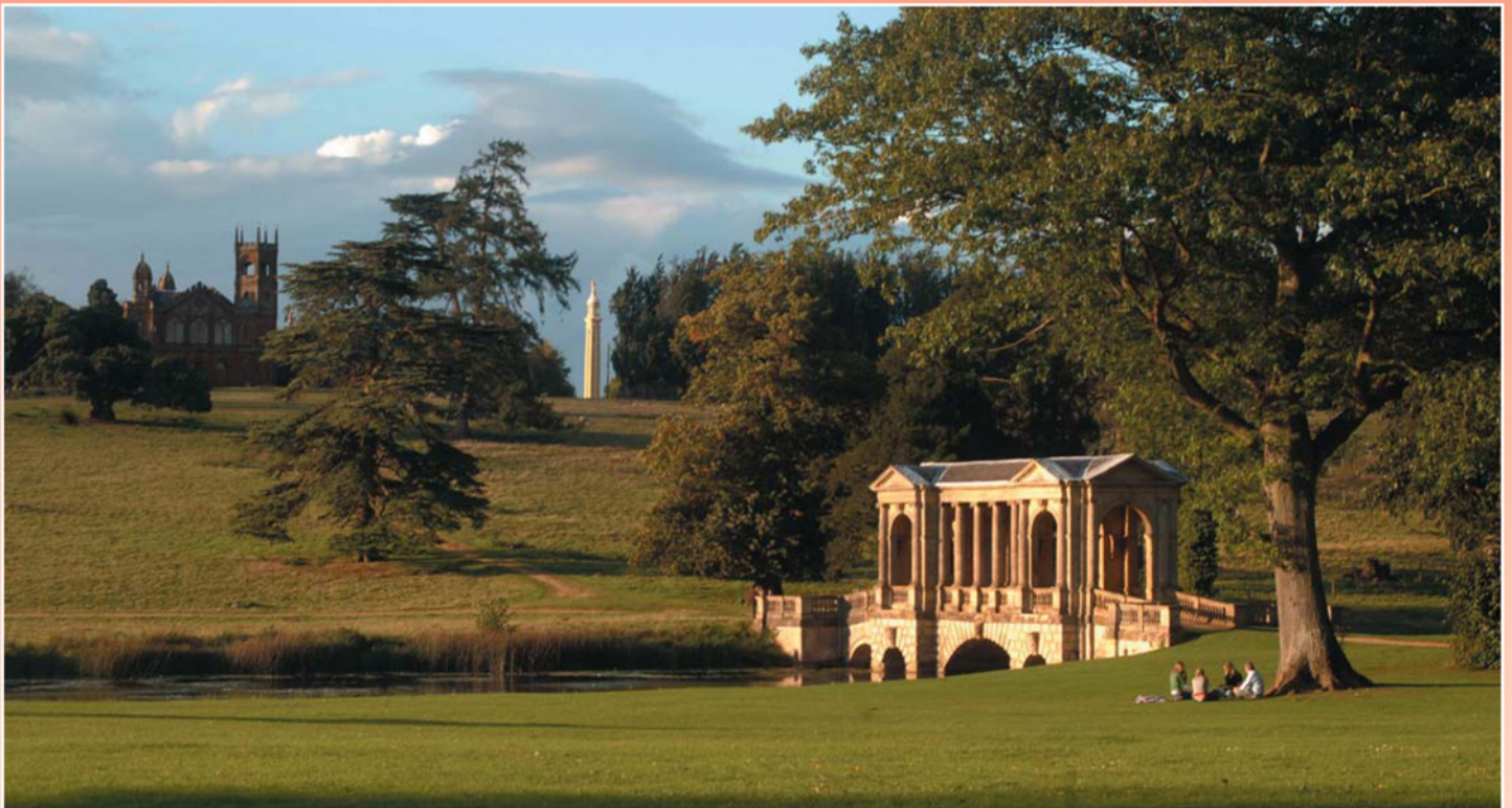
Picnic Palladian Bridge

The National Trust first took ownership of Stowe Landscape Gardens in July 1989.