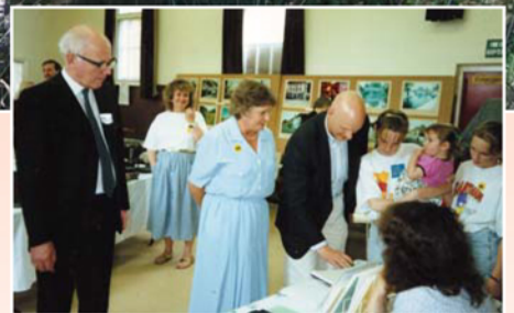
Duncan Goodhew visits a NPHS exhibition

history of the town and surrounding area written by local authors. The Society puts on regular displays of the artefacts and runs a regular programme of meetings for the public.