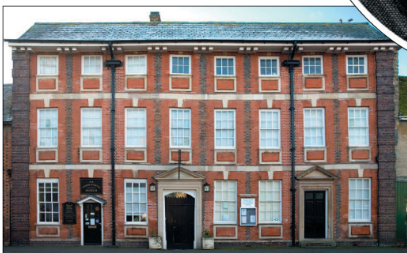
The Cowper and Newton Museum in Olney. Originally William Cowper's home