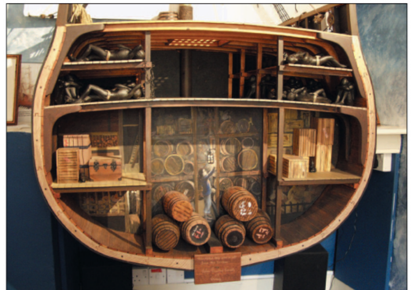
Model of a slave ship in the museum

After a long struggle the campaign was successful, and the slave trade was abolished throughout the British Empire in 1807, shortly before Newton's death.