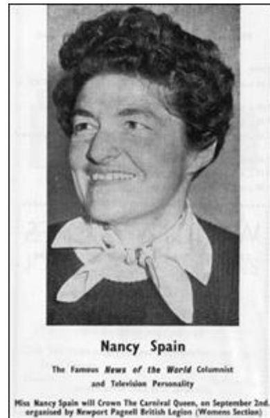
The first carnival was opened by Nancy Spain a News of the World reporter later sadly killed in an aeroplane accident.