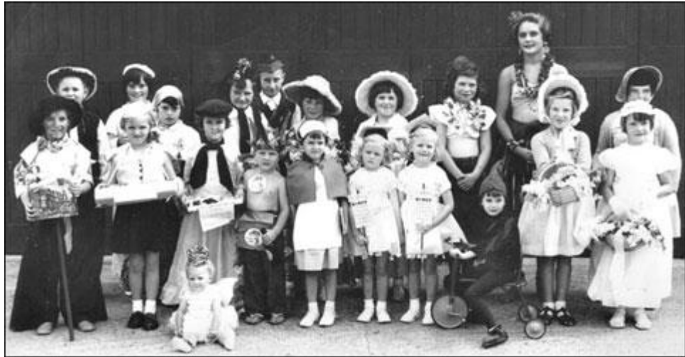
1961 The fancy dress competition at the rear of the St Johns Ambulance Hall in Silver Street. The winner was "Robin Hood" in the back row.