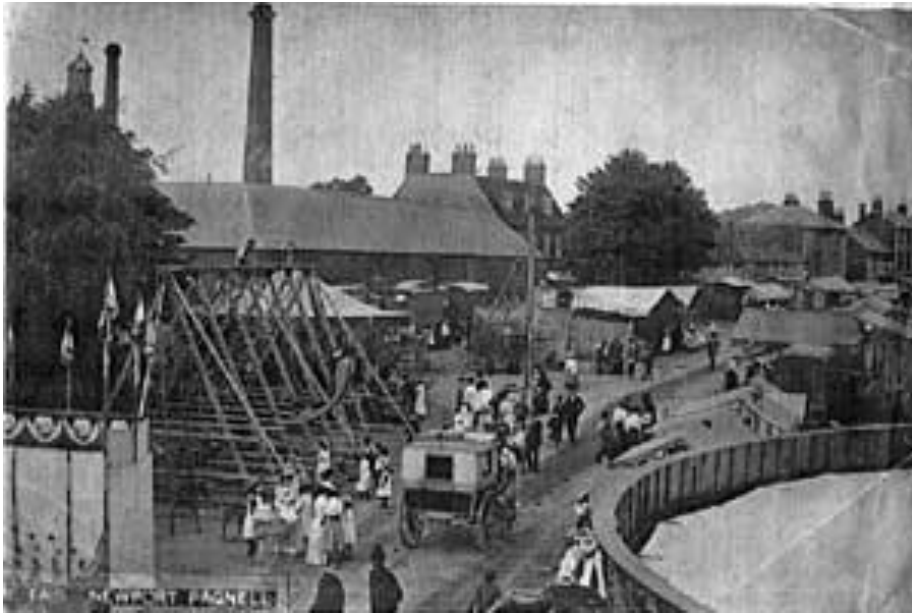
The Fair at Market Hill

The picture above is also of the fair in 1908. In the background is the Town Brewery with the Swan-Bus in the centre.