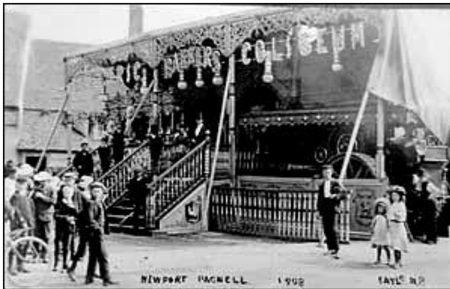
1908 Fair The old town fair that was held on the market hill, and more recently on the Bury Field common. The photo is dated 1908 and shows the traction engine that powered the rides of the time.