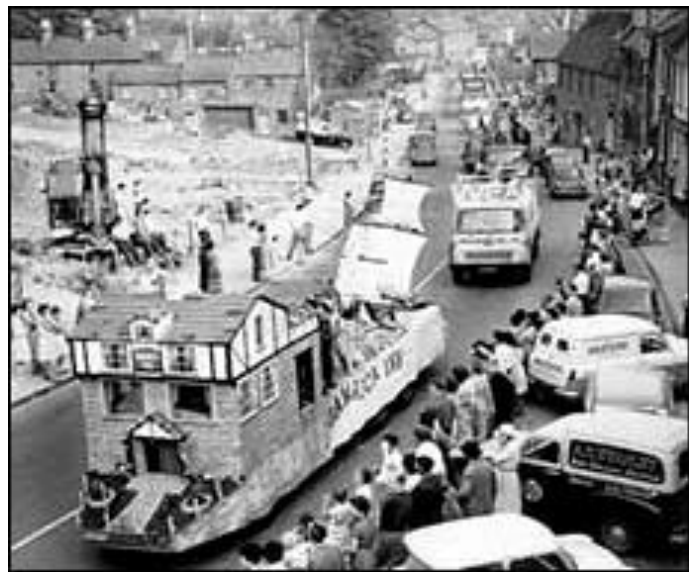
Still in 1961 the carnival floats going up St John Street. Notice the new buildings have still not been built after the 1958 demolition.