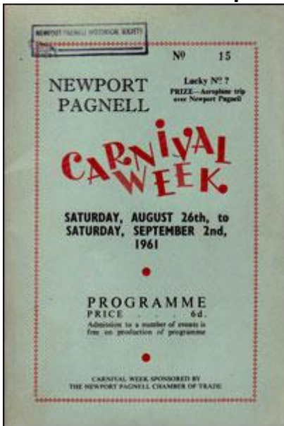
The first Carnival Programme.