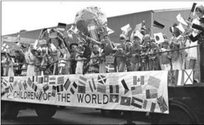
St. Luke's Church float 1972