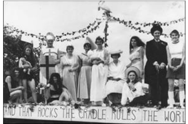
The Mothers Union float 1972