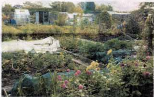
A more relaxed approach to growing at this site

occupation of his land, and his crop be taken at a valuation.