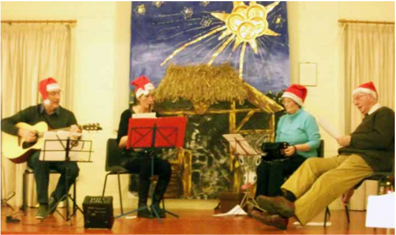
Leading the carols