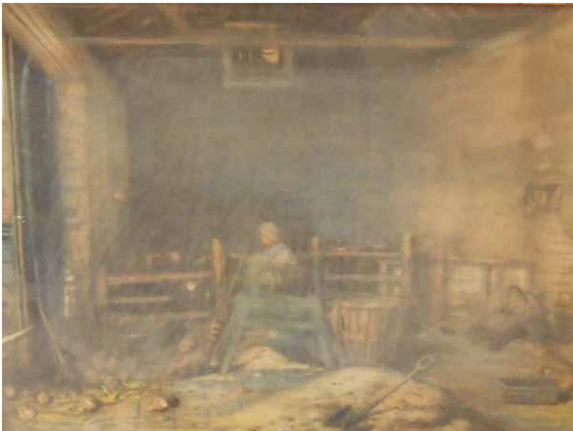
The lady in the barn