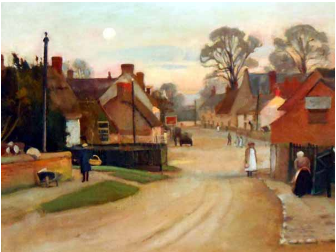
High Street, Sherington