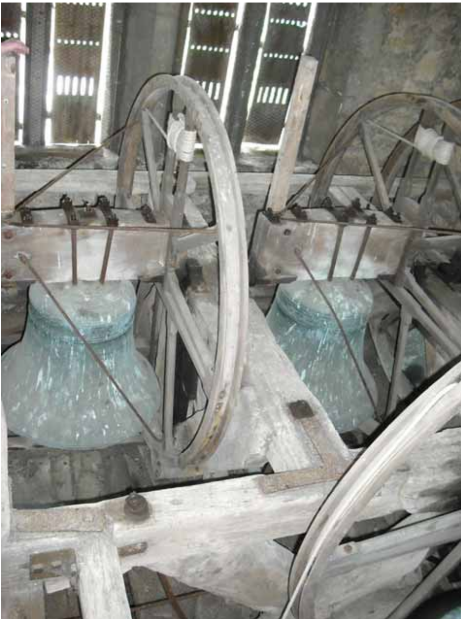
Bells 2 (to the left) and 3, with the ringing wheel of the Tenor to the right.