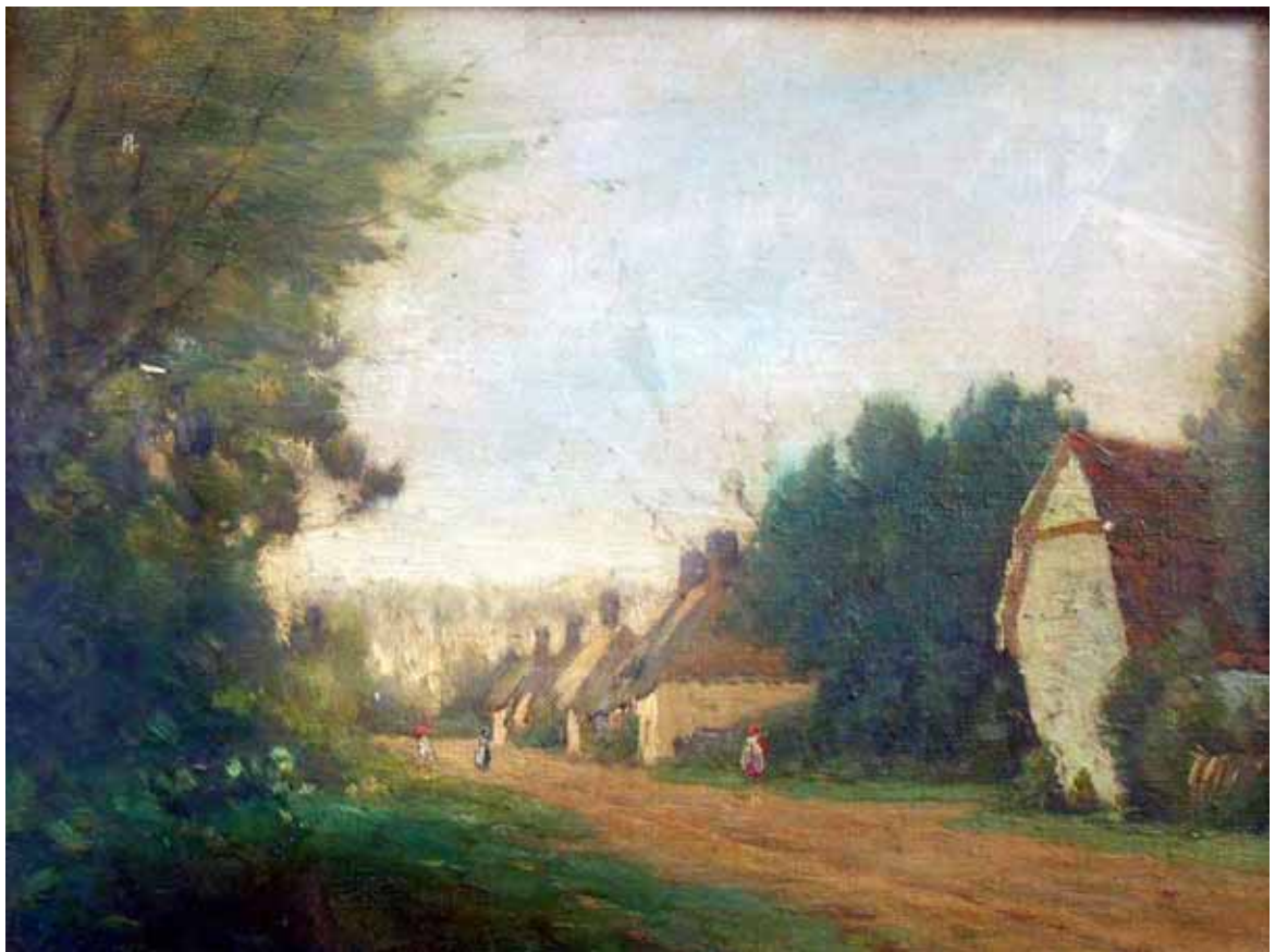
Gun Lane, Sherington