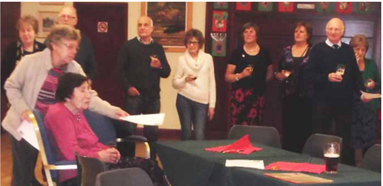
Watching the handbells and setting up the quiz