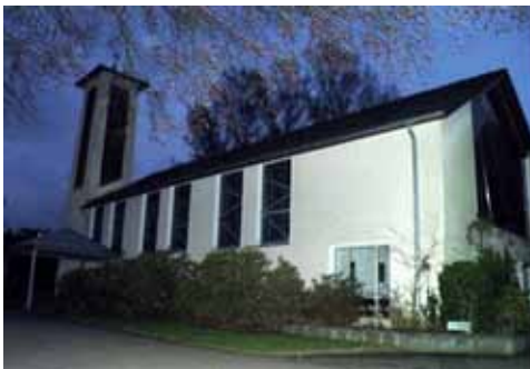
Entrance to Friedhof Kohlenstrass