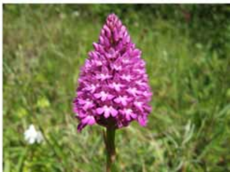
Pyramidal orchid