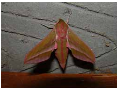
Elephant hawk-moth