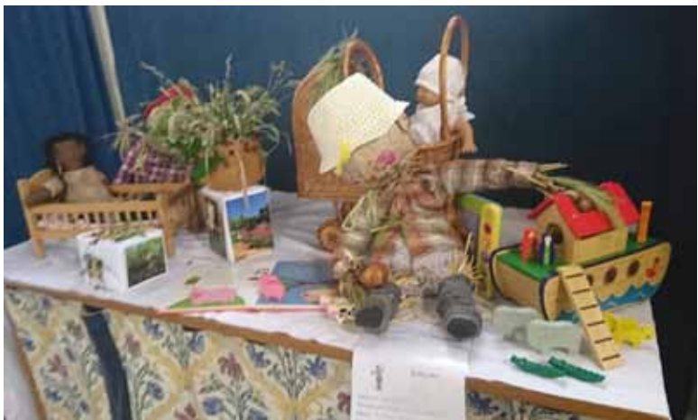
Third prize - Dingle Dangle Scaretots by Sheringtots