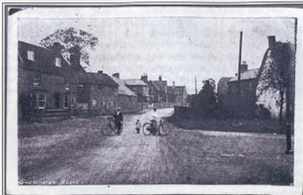
CYCLING FAMILY, HIGH STREET, C.1910