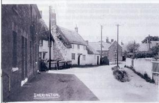
PARK ROAD, SHERINGTON