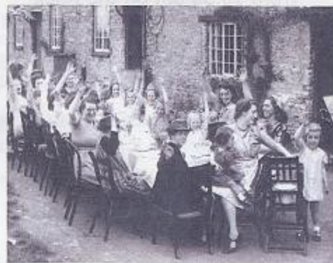
VE DAY, SHERINGTON STYLE