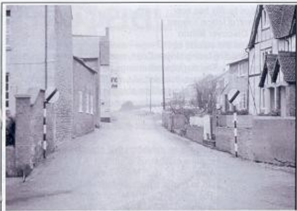
GUN LANE SHERINGTON