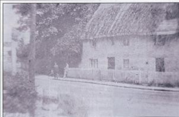
SOUTHERN END OF HIGH STREET, C.1920