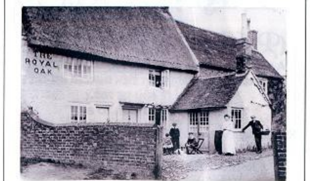
THE ROYAL OAK, CHURCH END (EARLY C20)