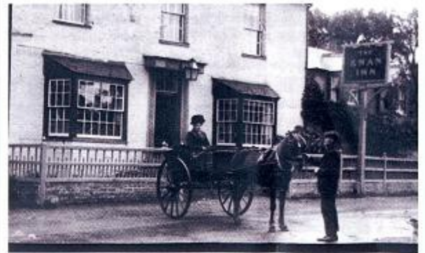
THE SWAN INN (WITH THE BAY WINDOWS)