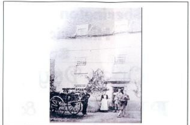
WHITE HART, C1900'S