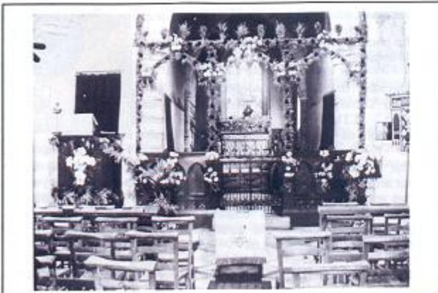
ST LAUD'S FLOWER FESTIVAL C1920'S