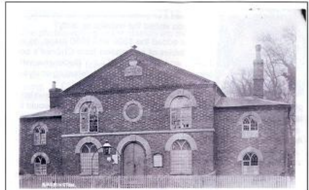
"SHERRINGTON" CHAPEL (PRE WWII)