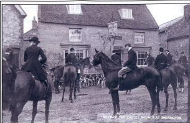
THE OAKLEY HUNT OUTSIDE THE CROWN AND CASTLE