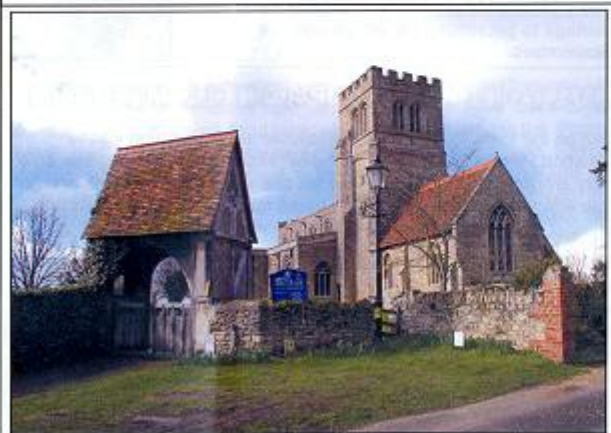
ST LAUD'S CHURCH, 2000