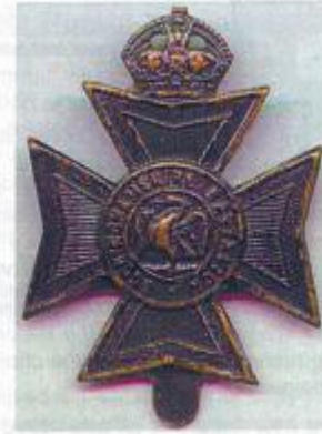
HOME GUARD CAP BADGE