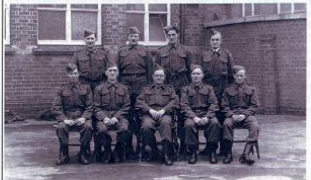
SHERINGTON HOME GUARD