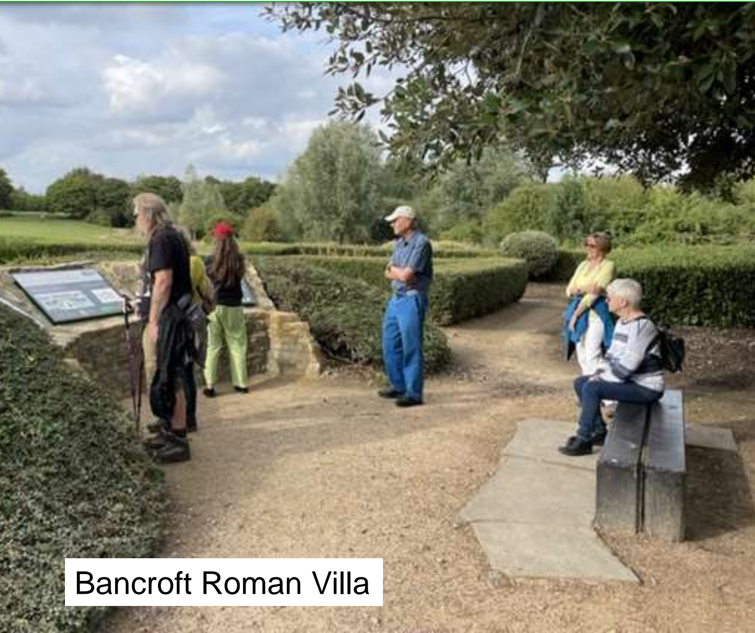
Bancroft Roman Villa