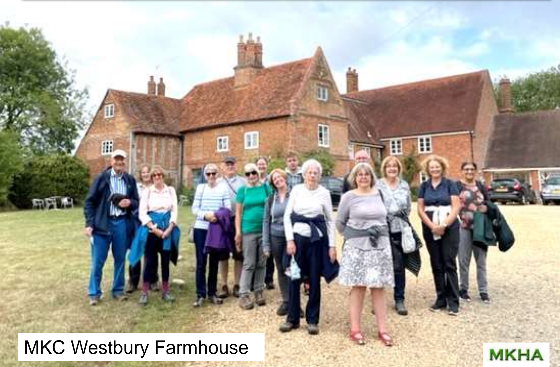
MKC Westbury Farmhouse