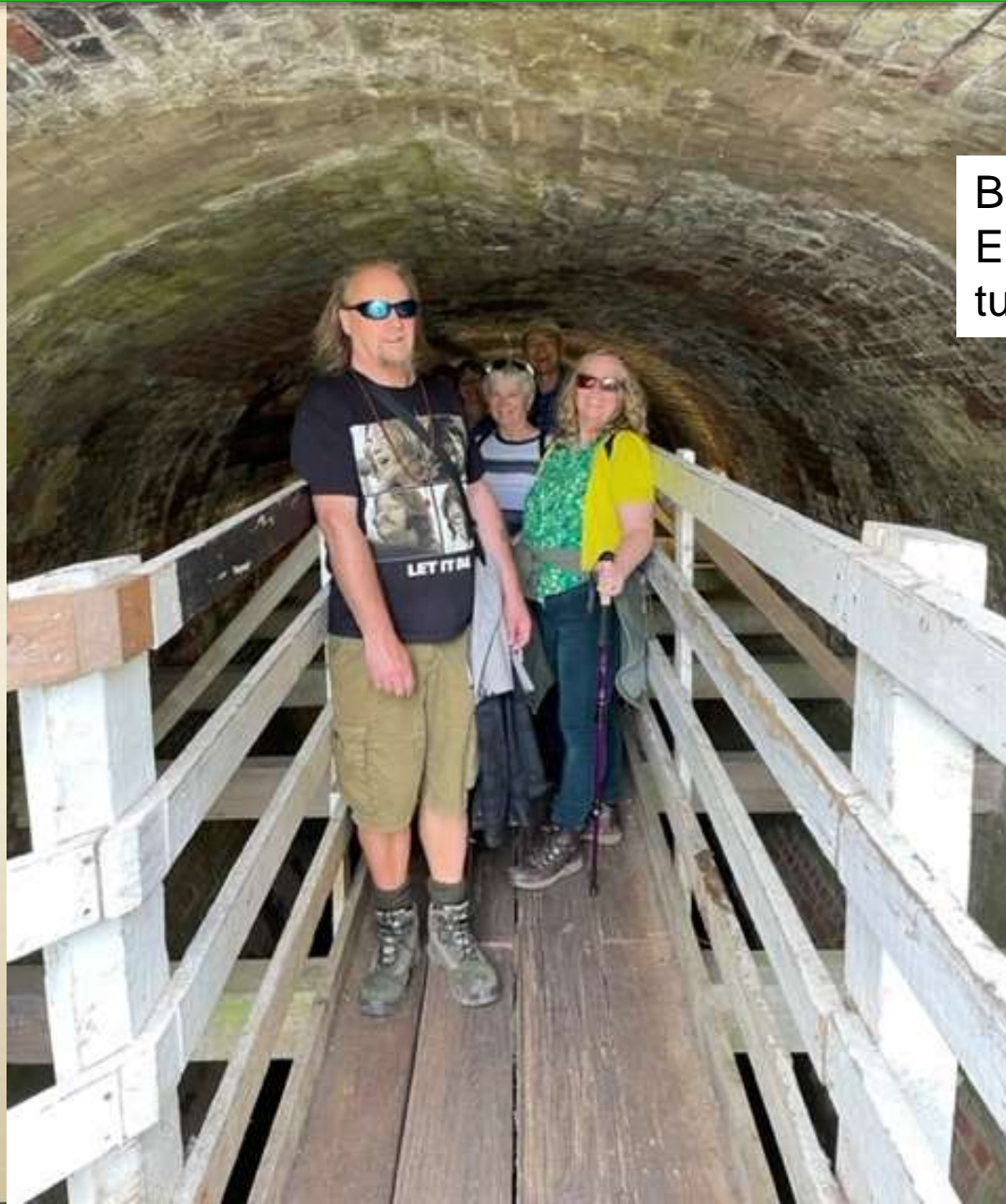
Bradwell Abbey – Embankment tunnel approach