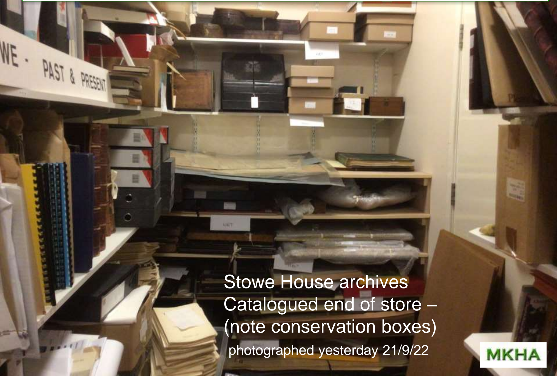
Stowe House archives Catalogued end of store – (note conservation boxes) photographed yesterday 21/9/22