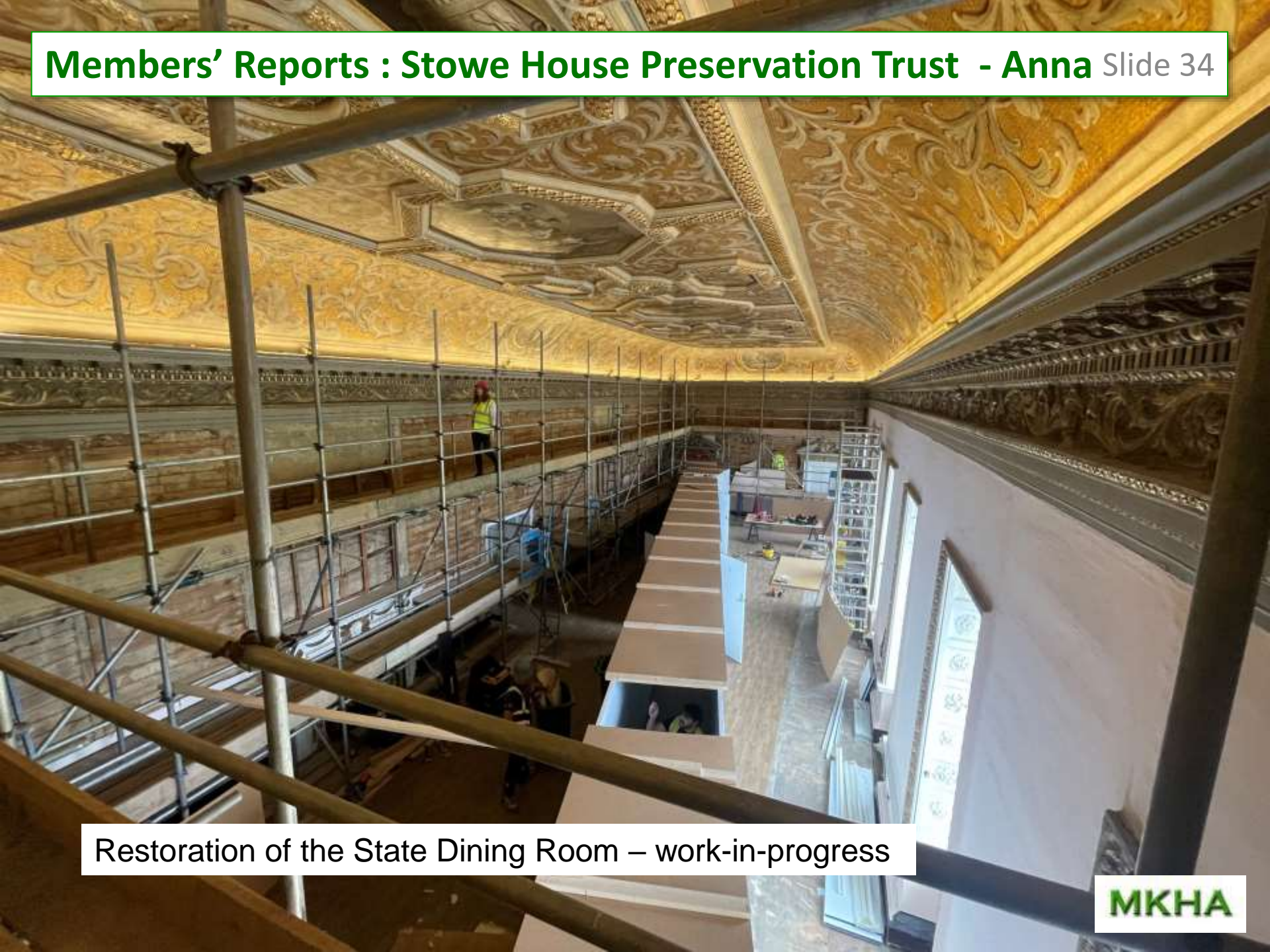
Restoration of the State Dining Room – work-in-progress