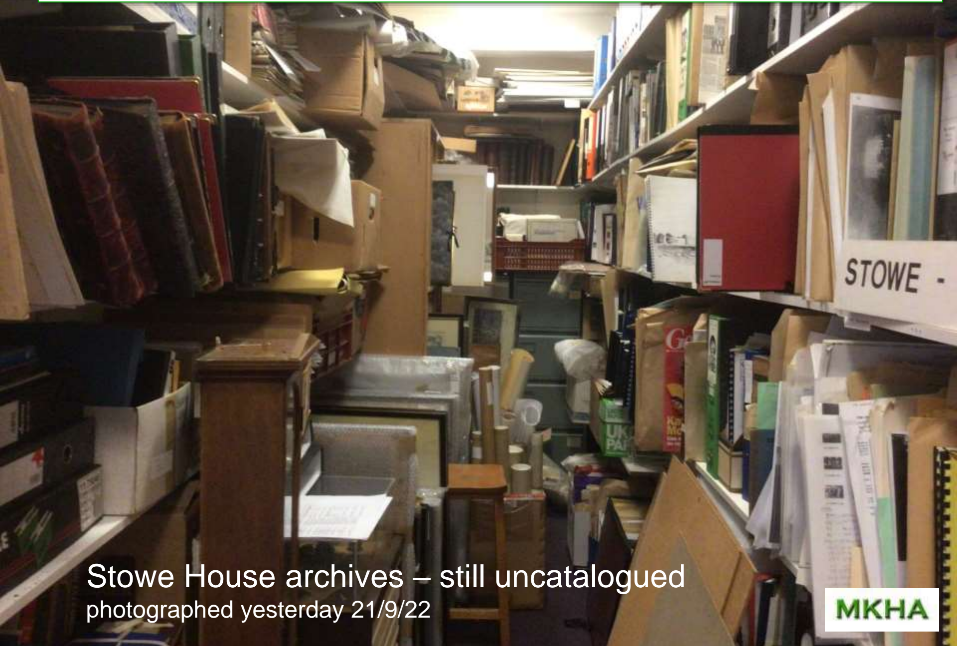
Stowe House archives – still uncatalogued photographed yesterday 21/9/22